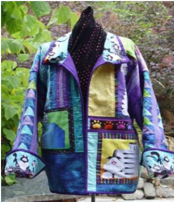
CATS AT PLAY 1