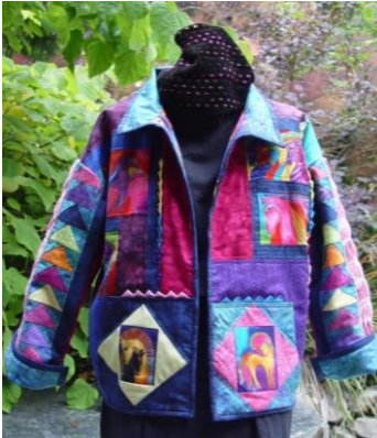
HORSING AROUND 1