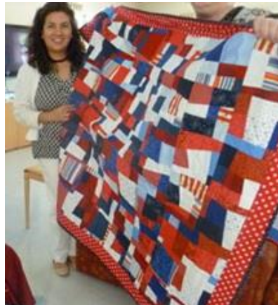
A nurse at the Veterans Hospital receiving our QOV for presentation to a special Veteran