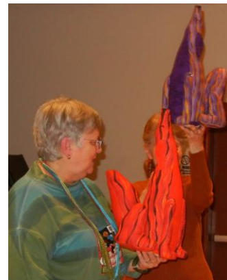
Soft Sculpture Coyotes by Kalynn Oleson