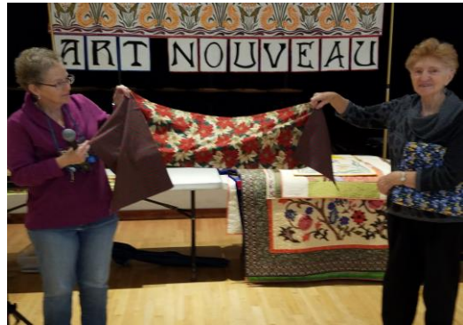
One of two Table runners by Cheryl Faconti