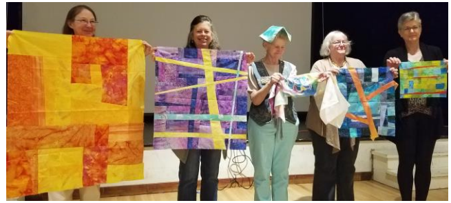
Class projects from Koolish workshop