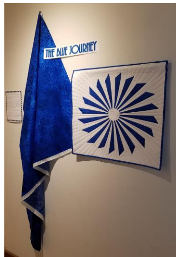
Entering the Gallery