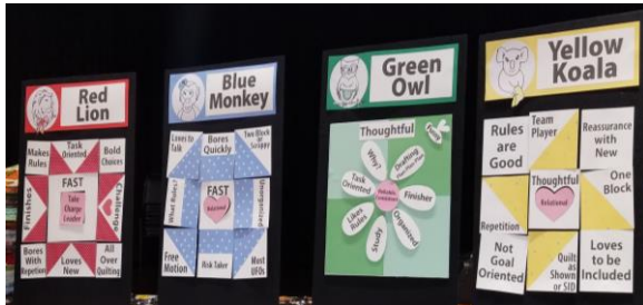
Lecture: "How a Quilter is Pieced" [Are you a Red Lion, a Blue Monkey, a Green Owl, or a Yellow Koala?]