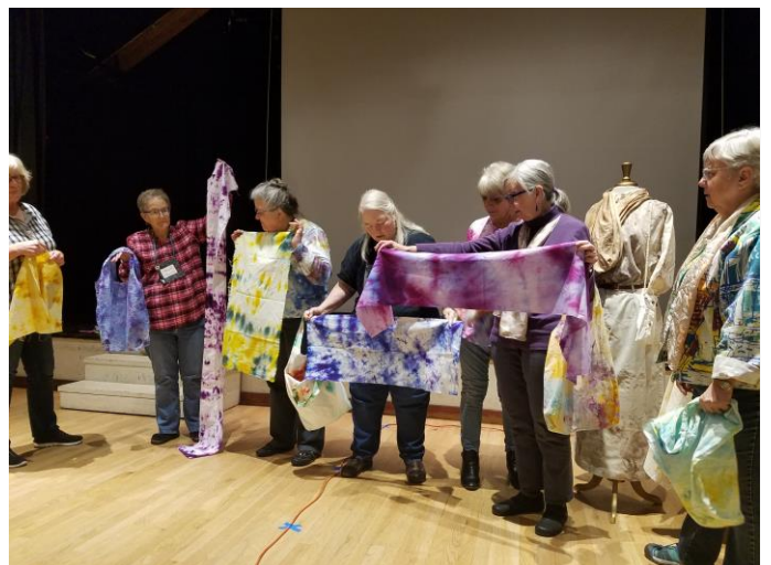
Wait, are we standing in a row again?!?!?!?