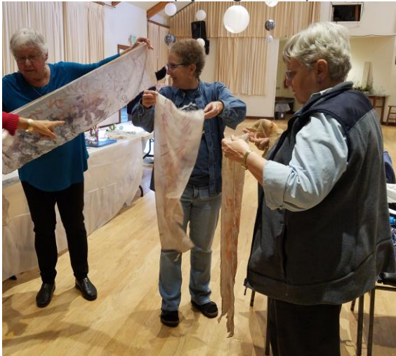
Wait? It's supposed to look like what?