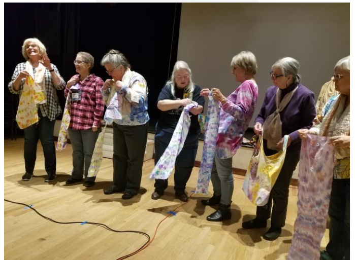
Workshop participants showing their finished items