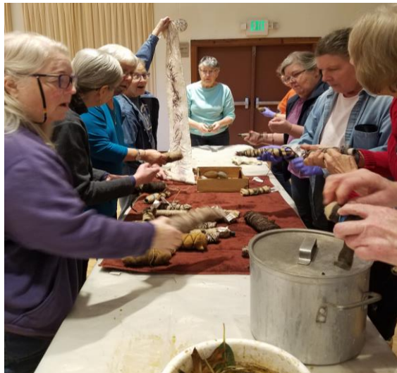
All the friendly quilters, standing in a row Are we happy quilters? "I" think so