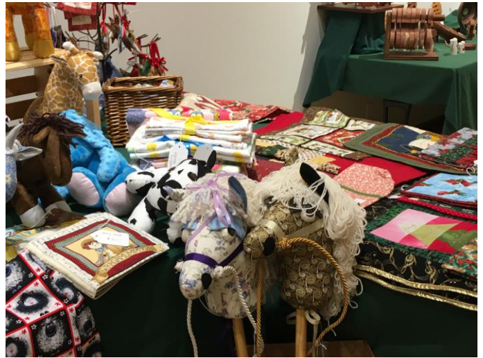
PPQG Booth – stick horses, stuffed animals, cloth books, Christmas items, etc