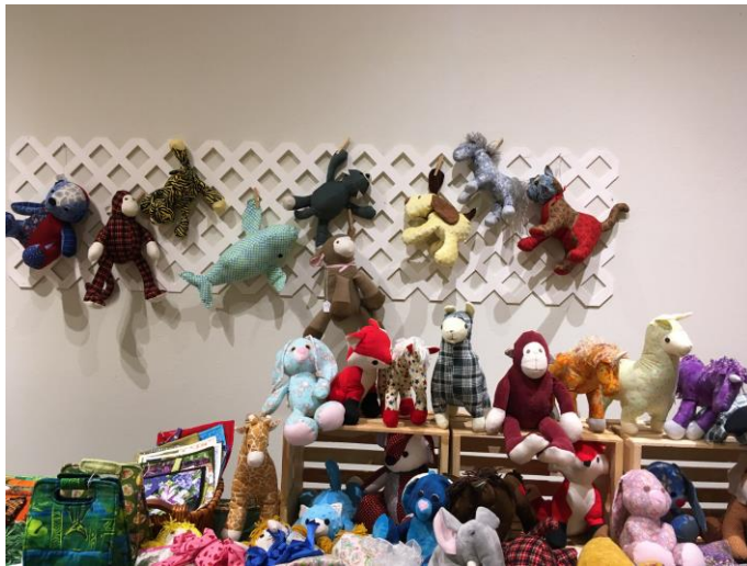
PPQG Booth—MANY stuffed animals thanks to Sylvia Keller's hard work!