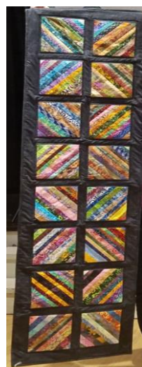
Table runner made by Cheryl Faconti for Festival of Trees