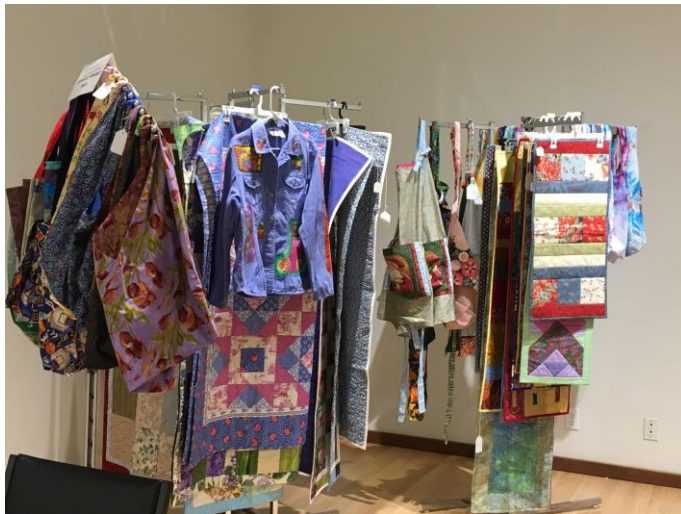
PPQG Booth ---Table runners, Bags, Aprons, etc.