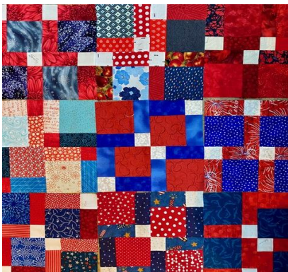
These are six of the Disappearing Nine-Patch blocks made at retreat for our 2020 Quilt of Valor.