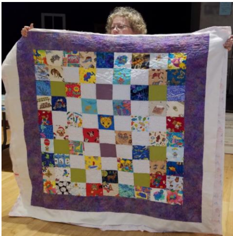
I-Spy by Pam Todd