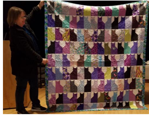
Finished UFO #2 by Monica Zarkowski