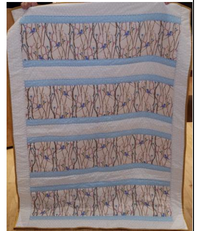
Comfort Quilt #2 by Janice Batchelder