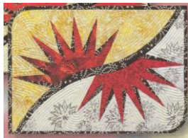
Broken Daisy Placemats (Sept 16)

Sept 16 & 17: Wed 10AM – 4 PM, Thurs 9:30AM – 4 PM. Two projects $85 for GAC members, $95 for non-member. Additional cost of $39 for both patterns (payable to Judy Riddle—cash only) Paper piecing workshop (Judy Neimeyer designs) with Jeanette Walton. See GAC website for details and supply list. You can sign up now!