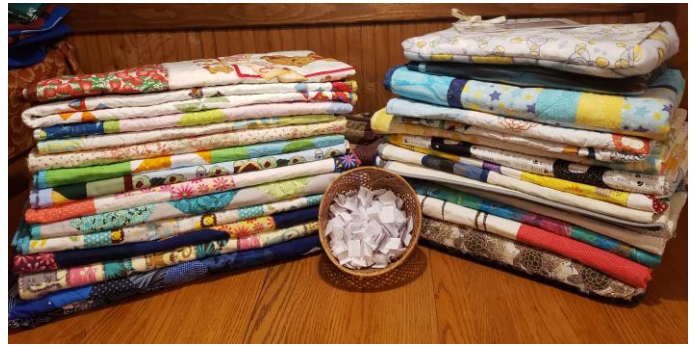
Quilts received for the March turn-in: