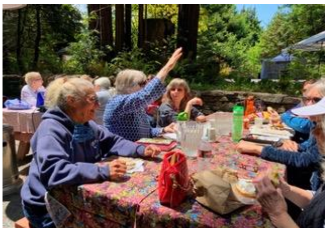
(I'll take a cookie and a piece of cake!)