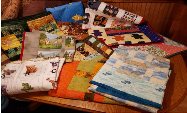
Quilts received for June turn-in

JULY 31 Turn in ..... Origami market bags, tote bags, microwave bowls or any Scandinavian Stars you've made 12:00-12:30