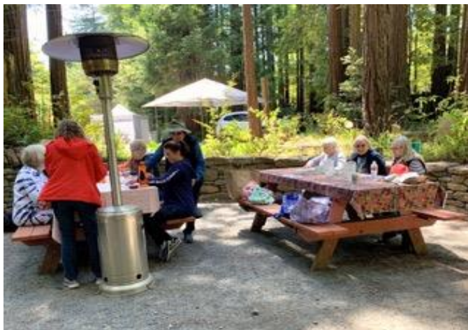
(YOU got QUILTO again! I want a new card!)

A picnic would not be complete without a few rounds of QUILTO. We had fun playing this traditional game, and went home with different fat quarters than we came with!