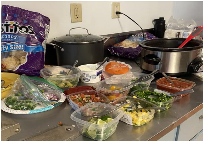
Taco Soup and toppings