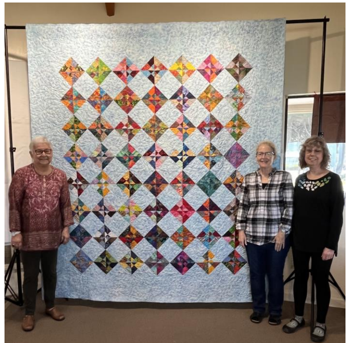
“Colors of the World”