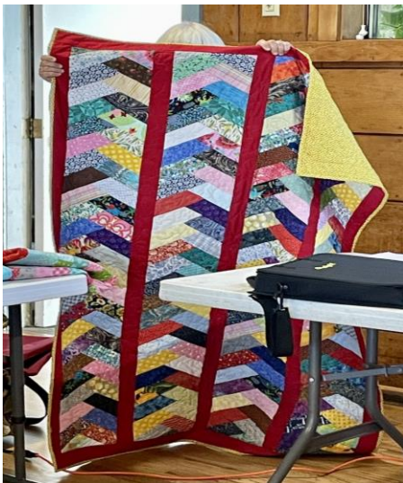
Comfort Quilt completed by Janice Batchelder