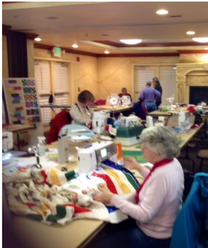
(Yes, we do have time to do some quilting!)