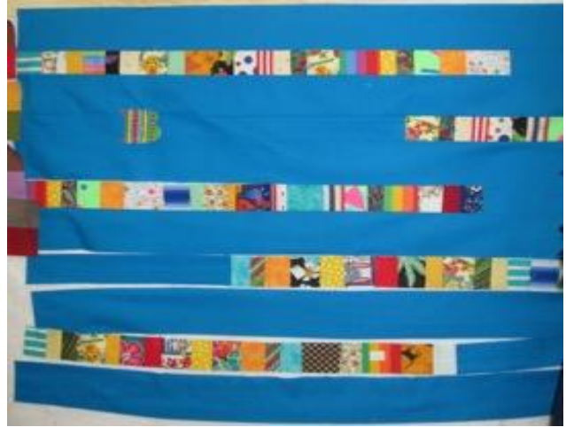
(Look at these beautiful bright colors)

Here is a picture of a project worked on last year by Dee Goodrich