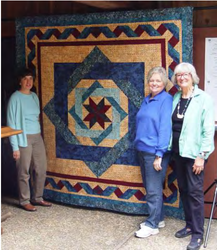
2014 Art In The Redwood Quilt "Labyrinth"