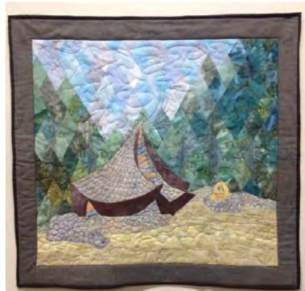
3 rd Place Janet Sears "The Sea Ranch Chapel"