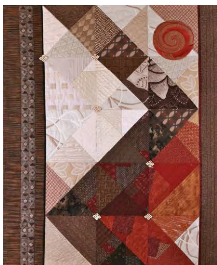
"T'ung Jen—Fellowship/Heaven Over Fire (Hexagram 13 of I Ching)"