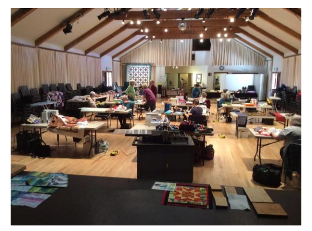
And this is how we work!