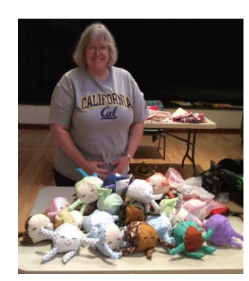
Humpty Dumpty by Francie Angwin