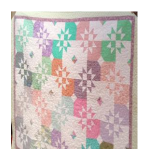
AIR Quilt by Dee Goodrich