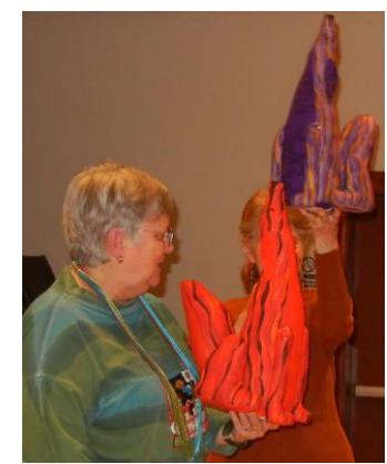
Soft Sculpture Coyotes by Kalynn Oleson