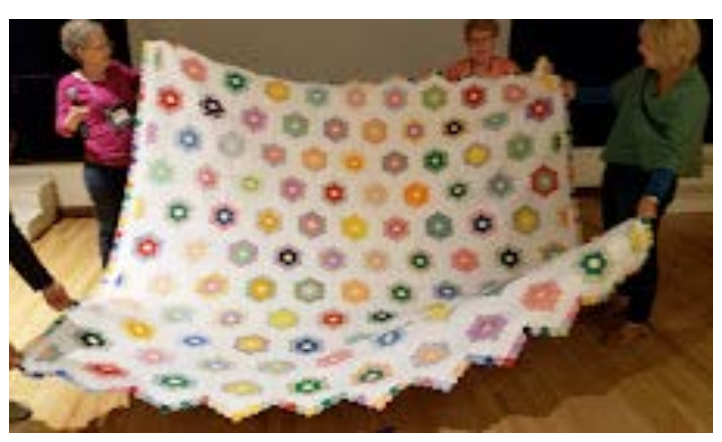
Sally Ramsay - large Grandmother's Flower Garden Guilt , quilted by hand.