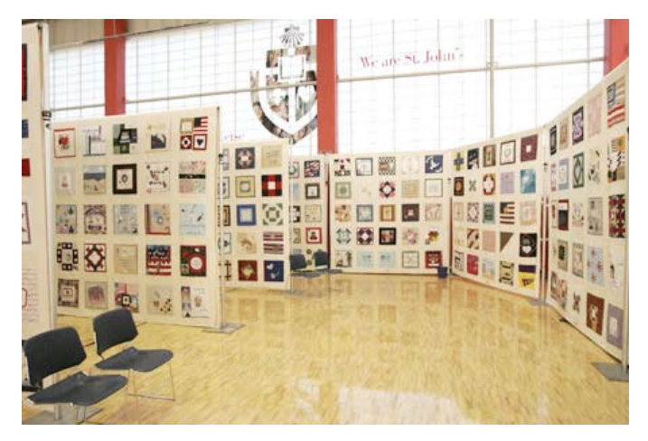
craft fair, pancake breakfast, etc. but the two main attractions were a quilt show at the high school and the United In Memory 9–11 Victims Memorial Quilt on display at the local arena.

I hope you have all been enjoying these lazy, hazy, With the 9th anniversary of 9/11 coming up this month, I have been thinking a lot about a quilt show I went to in 2004 in the quaint little town of Panguitch, Utah. It was the 7th Annual Quilt Walk Festival. There were a lot of activities such as a