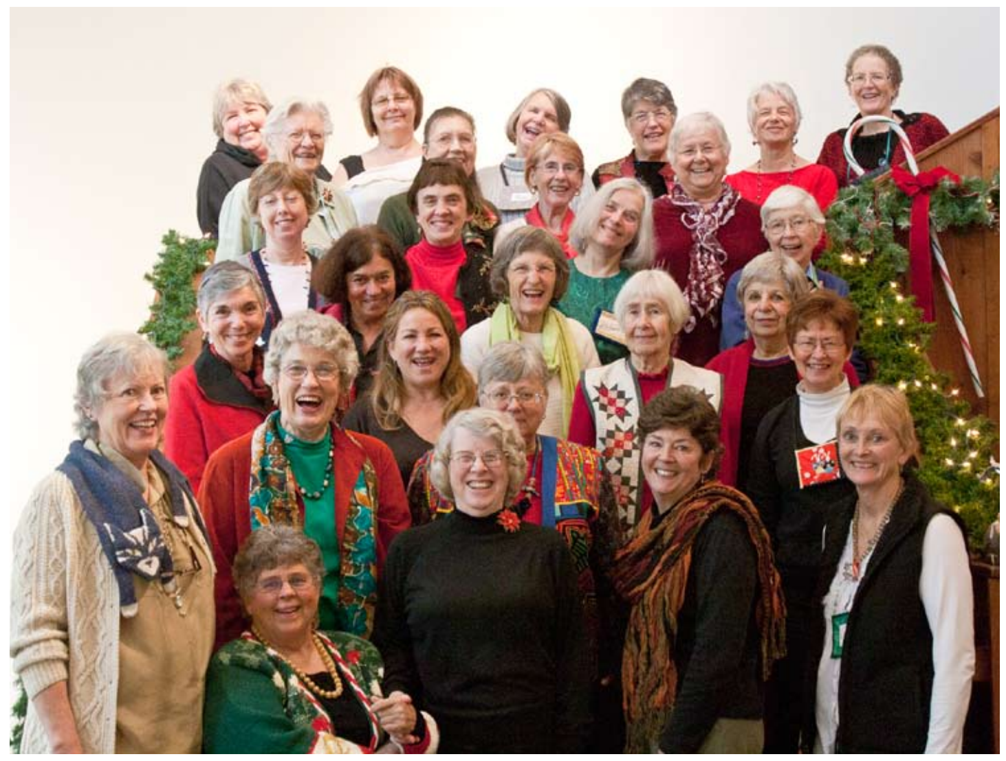
A merry band of quilters enjoyed the guild Holiday luncheon on December 12.