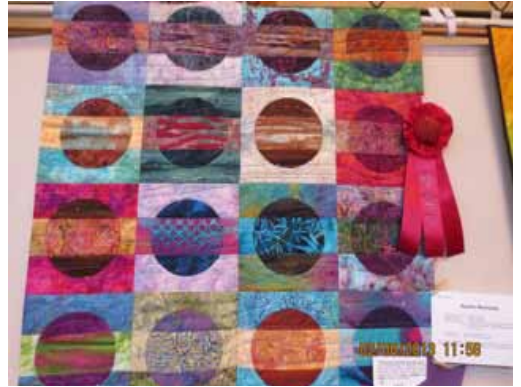
Congratulations to both!