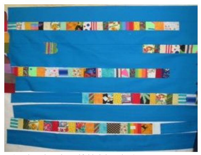
(Look at these beautiful bright colors)

Here is a picture of a project worked on last year by Dee Goodrich