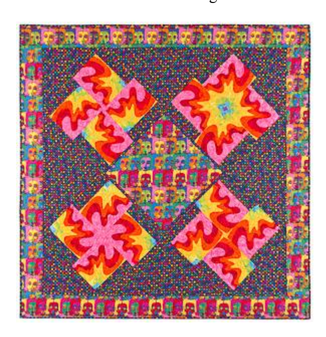
September 19: Guild Meeting with Lecture by Cara Gulati.

September 18: "Voluptuous Applique", one day workshop by Cara Gulati, 9:30-4:00. You'll learn to create your own original block design. Learn to design your own blocks with wild curvy seams. Freezer paper, glue and invisible thread are some of our tools. A light box creates transparency. Color gradations can make amazing impact! Check the PPQG website for the materials list. We will have light boxes available.