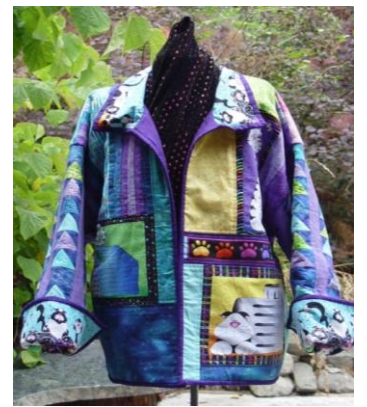
CATS AT PLAY 1