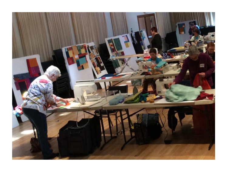
Of course I talk to myself when I quilt. Sometimes I need expert advice.