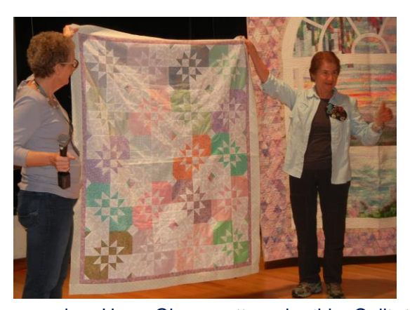
Disappearing Hour Glass pattern in this Quilt top made by Dee Goodrich.