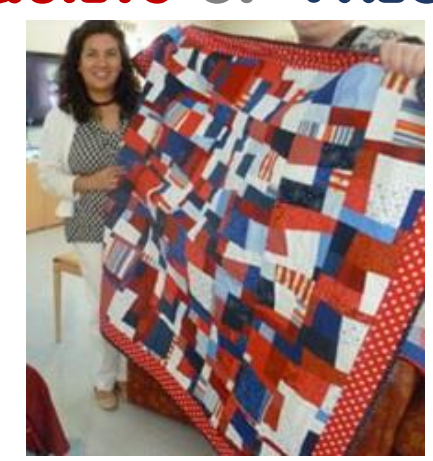
A nurse at the Veterans Hospital receiving our QOV for presentation to a special Veteran