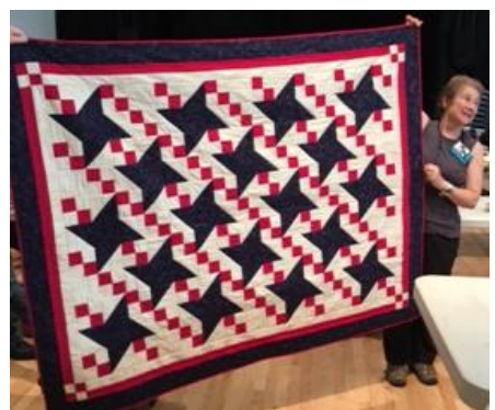
Dee Goodrich Quilt of Valor