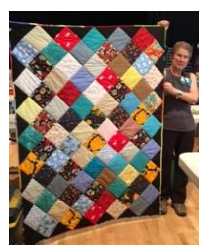
Dee Goodrich Comfort Quilt