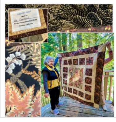
Dee Goodrich Comfort Quilt