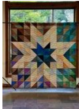
AIR Quilt 2025