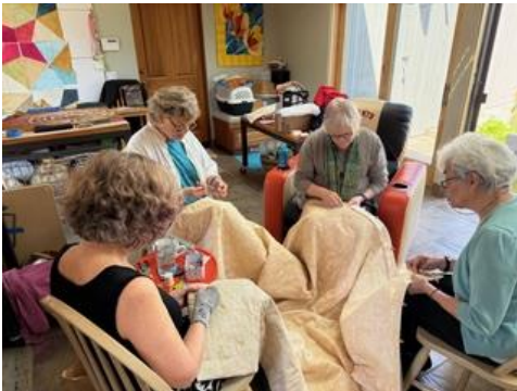
"Quilting Bee" sewing on the binding by hand.