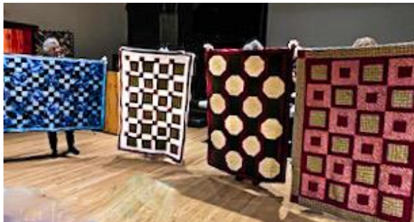
Quilts from Comfort Quilt Workshop