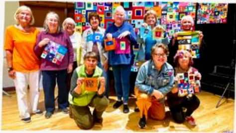
Members of Mosaic workshop