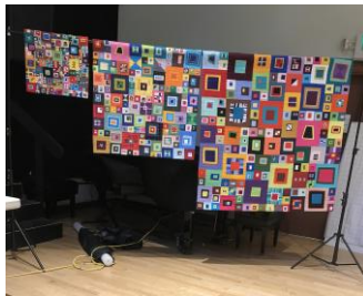
Lorraine Woodruff-Long mosaics