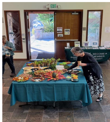
Food Table at the Challenge

Everybody brought fabulous foods. Our Hors D'oeuvres Table was gorgeous. I mean, I can't thank you all enough.