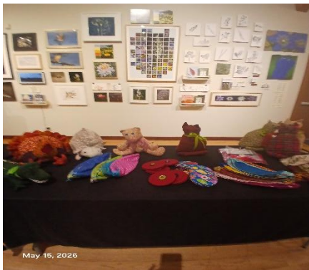
Fundraising Fun May 2026

We can use more aprons and tortilla warmers.