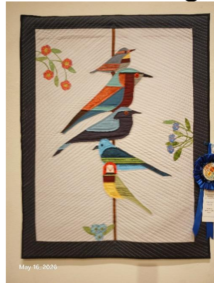
1 st – Bonnie Coffee-Smith