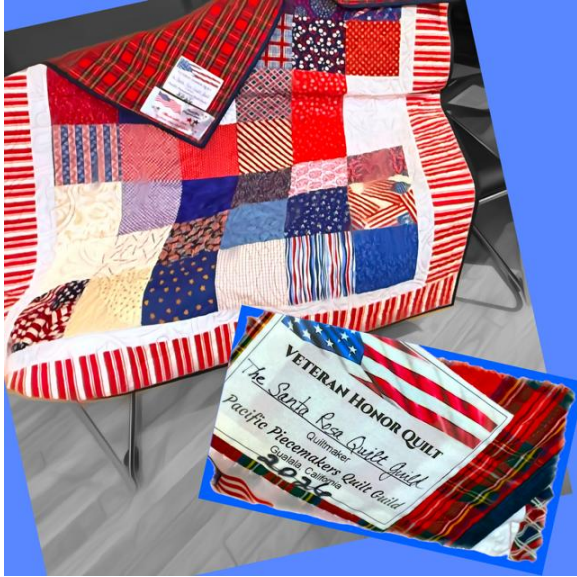
Quilt from Santa Rosa Quilt Guild