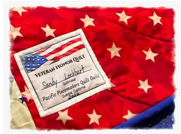
Sandy Lockhart's Label from VHQ Quilt