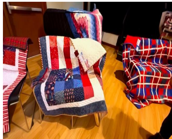
Some of the VHQ Donations