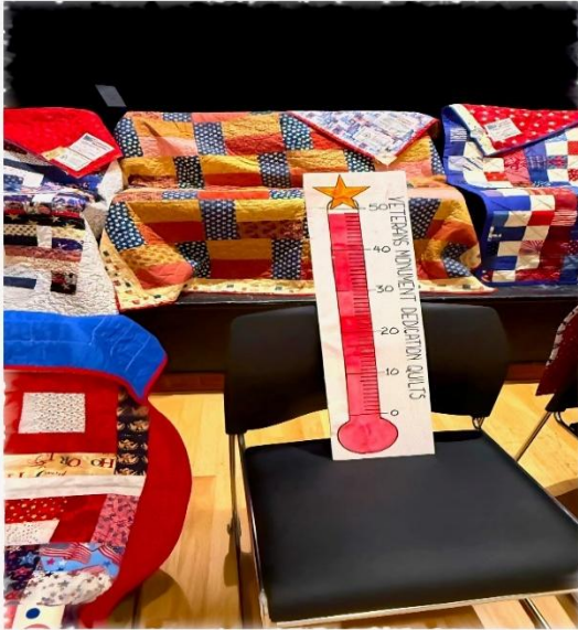
Display of VHQ Quilts and Label