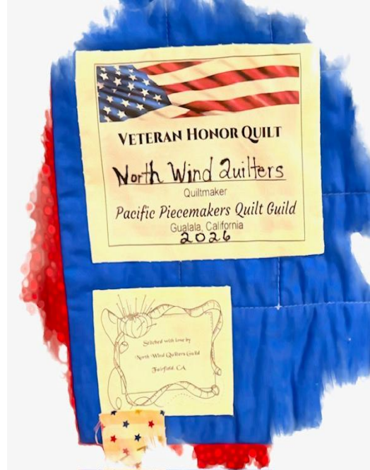
Label from North Wind Quilters Donation