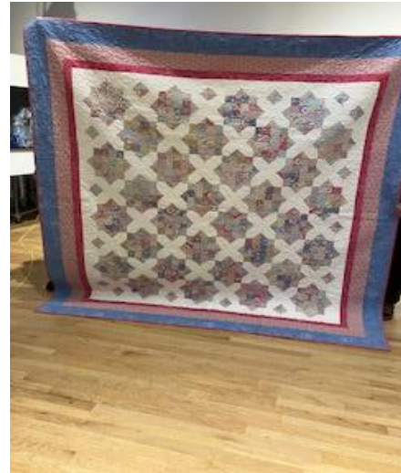
AIR QUILT 2026