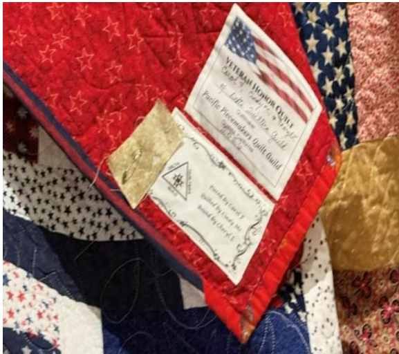
Donation from Little Quilters Guild